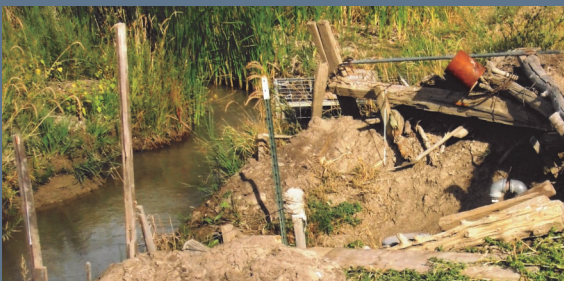
Headgates and diversions in need of rehabilitation would be addressed in the study.

At the request of the Wild Rose Water Improvement and Service District and the Alliance Lateral Ditch Company, the Sheridan County Conservation District agreed to sponsor an application for a Level I Assessment of the Goose Creek Watershed through the Wyoming Water Development Commission.